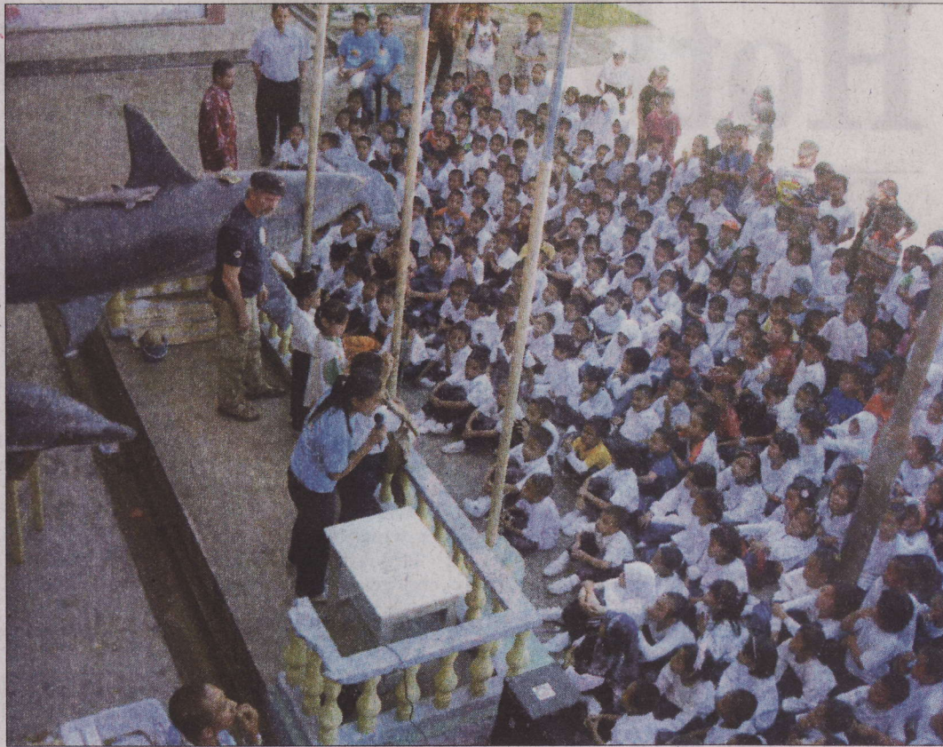
Students getting to know the types of marine creatures in our waters.