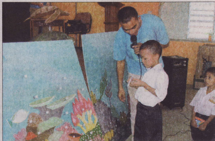
Top and below: Students involved in activities.